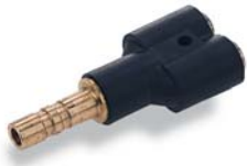
Pneufit Stem "Y"*