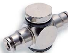
Pneufit Banjo Tee