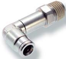
Pneufit Extended Swivel Male Elbow