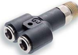
Pneufit Male Swivel Y*

CAUTION: Swivel adapters are not suitable for use in continuously rotating or gyrating applications.