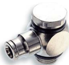
Pneufit Banjo Elbow