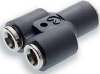
Pneufit Parallel Union "Y"*