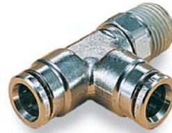
Pneufit Swivel Male Side Tee