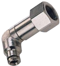
Swivel Female Elbow

CAUTION: Swivel adapters are not suitable for use in continuously rotating or gyrating applications.