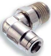
Pneufit Swivel Male Elbow

CAUTION: Swivel adapters are not suitable for use in continuously rotating or gyrating applications.