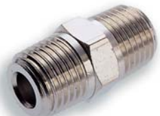
Pneufit ISO R Hex Nipple